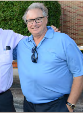
ther, Pipe Fitters Local 597, UA , Business Agent, Tech Engineer