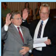
Officers Installed at July 14 Meeting