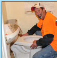
Volunteers Answer Call to "Rebuild Together"

2 New Fund to Target Lost Work Target Fund Will Drive Market Recovery Effort