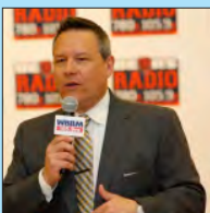
Retirees Welcome Bears Sportscaster